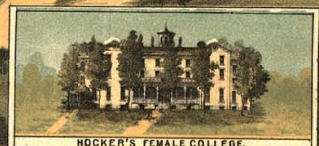
HOCKER'S FEMALE COLLEGE.